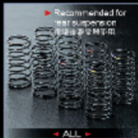
31mm Soft coil spring set (8) 31mm 軟避震彈簧組 (紅)