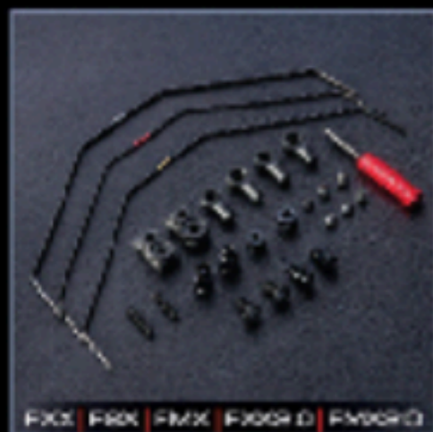
FXK Rear stabilizer set FXK 後防傾器