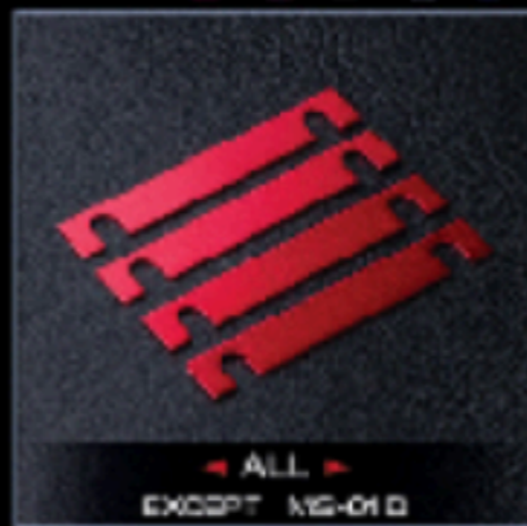
Suspension mount spacer 0.5mm (4) (red) 避震器墊片 0.5mm (4) (紅)