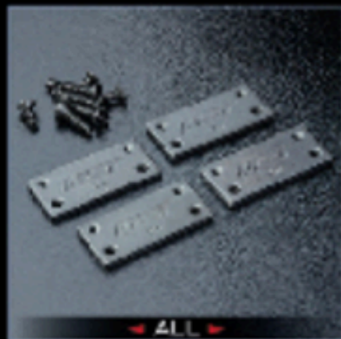
MST Balancing weights 10g (4) MST 配重片 10g (4)