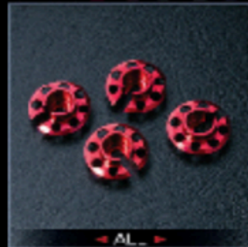
Alum. damper retainer (red) (4) 鋁合金避震器 (紅) (4)