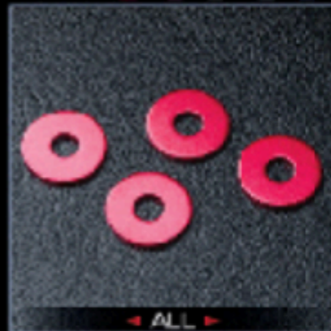
Wheel hub spacer 1.0 (rec) (4) 輪軸墊片 1.0 (紅) (4)