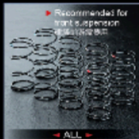
31mm Hard coil spring set (8) 31mm 硬避震彈簧組 (紅)