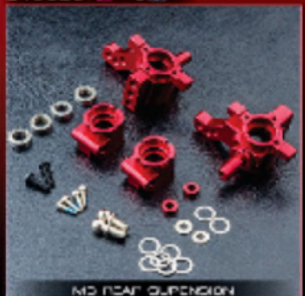
MB Alum. Rear upright set (red) MB 鋁合金後上避震架 (紅)