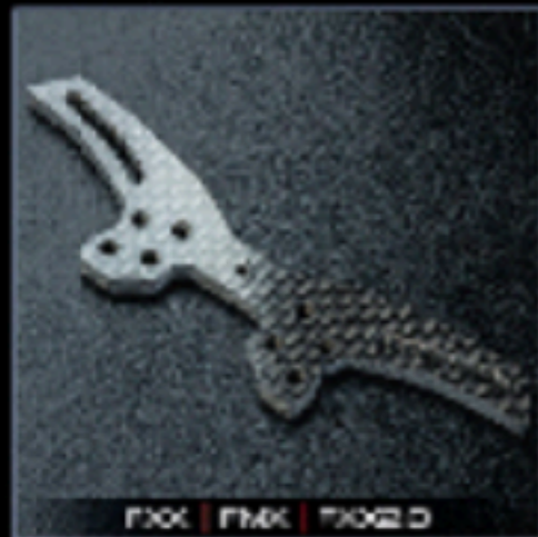
FXK Carbon front damper stay 3.5 FXK 碳纖維前避震器 3.5