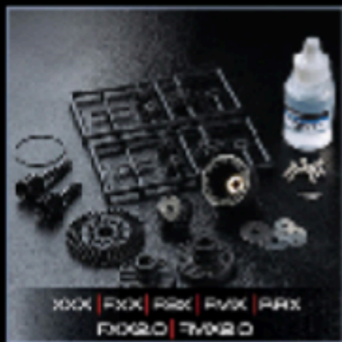
XXX Reinforced bevel cliff assembly XXX 強化凸角避震器