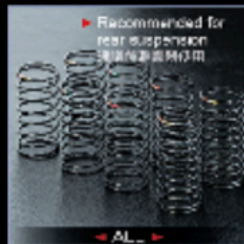
31mm Super-soft coil spring set (8) 31mm 超軟避震彈簧組 (紅)

More details, please refer to MST website. | 更多詳情請到官網上查詢 rc-mst.com