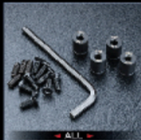
MST Balancing weights 2.5g (4) MST 配重片 2.5g (4)