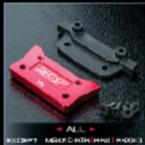
Alum. balancing weights adaptor (red) 鋁合金配重器轉接片 (紅)