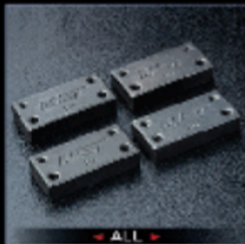
MST Balancing weights 30g (4) MST 配重片 30g (4)