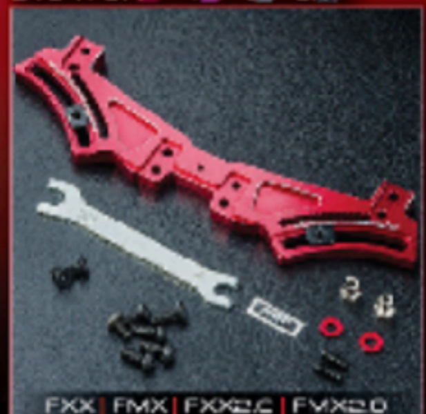
FXK Alum. rear quick adj. damper stay (red) FXK 鋁合金後快調避震器 (紅)