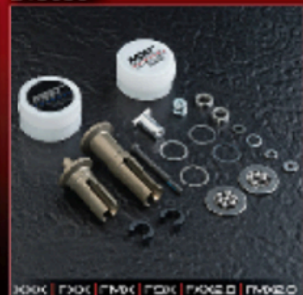
Alum. ball diff. joint set 鋁合金球差速器轉接架