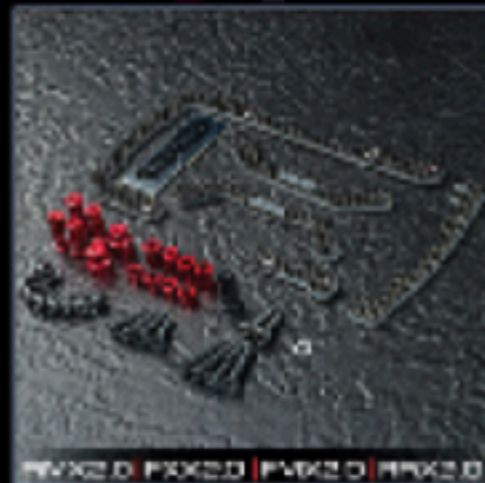
Carbon short battery holder set (red) 碳纖維短電池架 (紅)