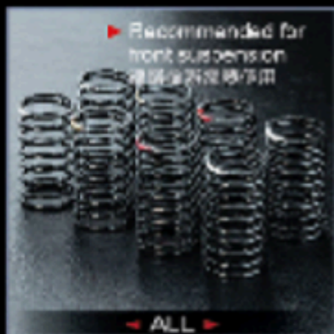
25mm Coil spring set (8) 25mm 避震彈簧組 (紅)