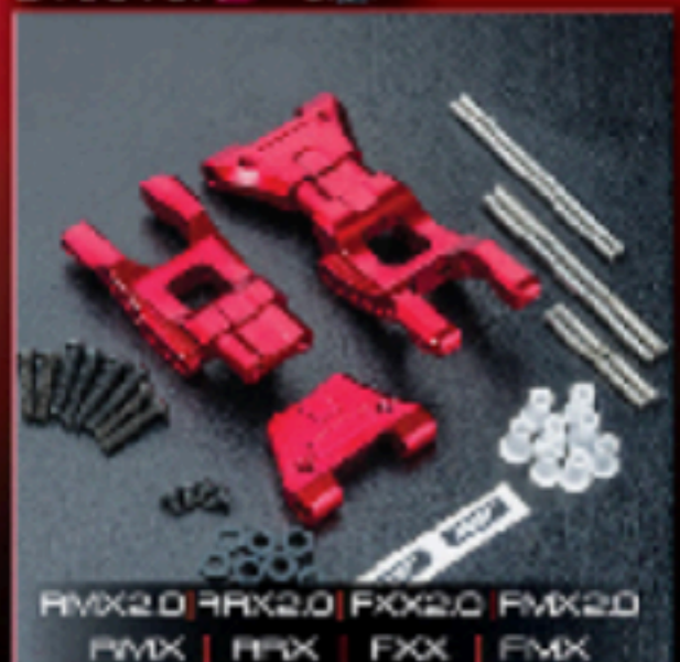
MB Alum. Rear lower arm set (red) MB 鋁合金後下避震架 (紅)