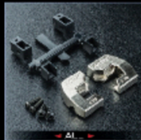
Upright weight 10g 垂直配重片 10g