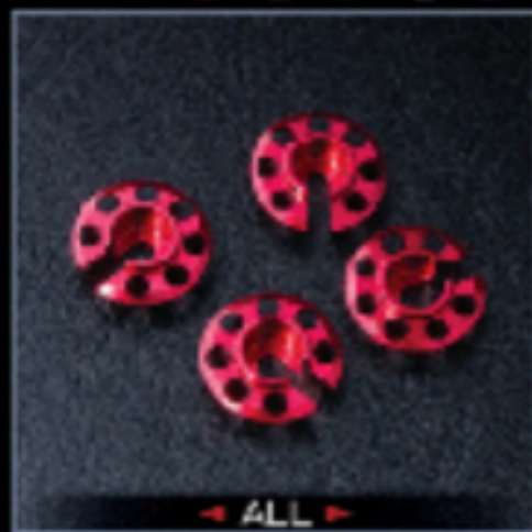
Alum. damper retainer (lower type) (4) (red) 鋁合金避震器 (下型) (4) (紅)