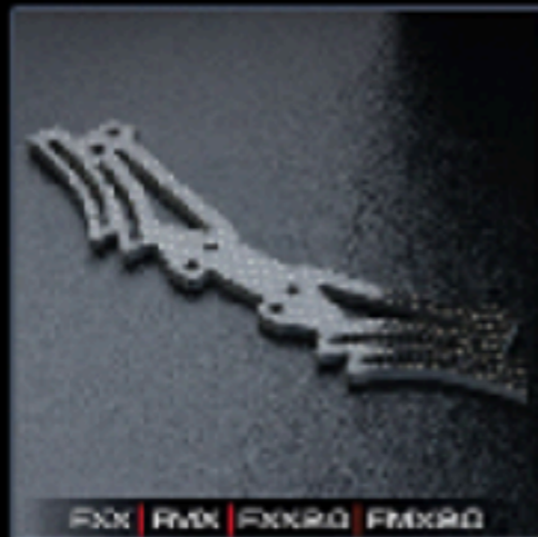
FXK Carbon rear damper stay 3.5 FXK 碳纖維後避震器 3.5