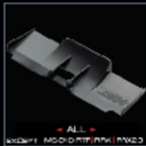
MST Diffuser MST 後避震架